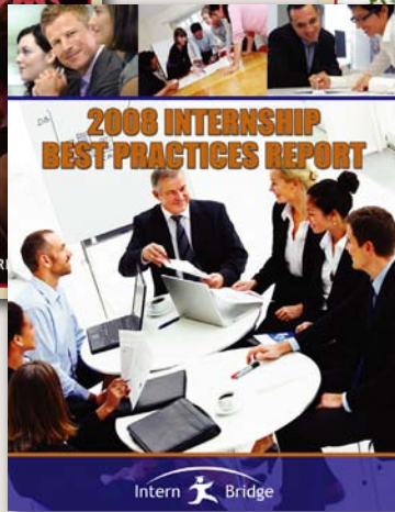
2008 INTERNSHIP BEST PRACTICES REPORT