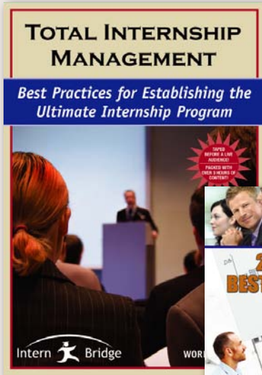
BEST PRACTICES WORKSHOP DVD