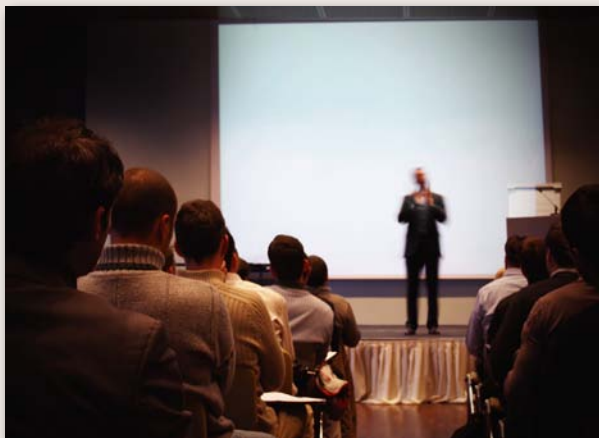
COLLEGE RECRUITMENT WORKSHOPS AND CONSULTING SERVICES

FOR ADDITIONAL FREE RESOURCES & MORE INFORMATION VISIT: WWW.INTERNBRIDGE.COM