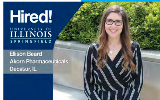
Biology Major to Aseptic Core Monitor