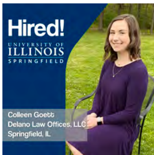
Legal Studies major to Legal Receptionist