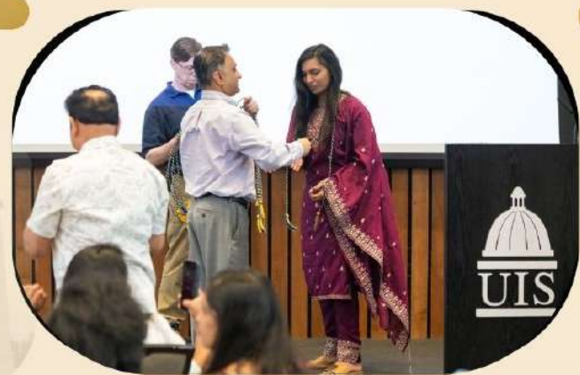
International Congratulatory Ceremony