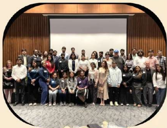
Professional Etiquette Dinner