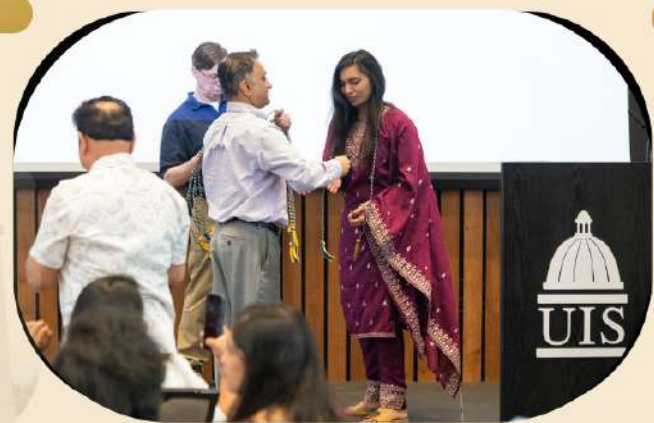
International Congratulatory Ceremony