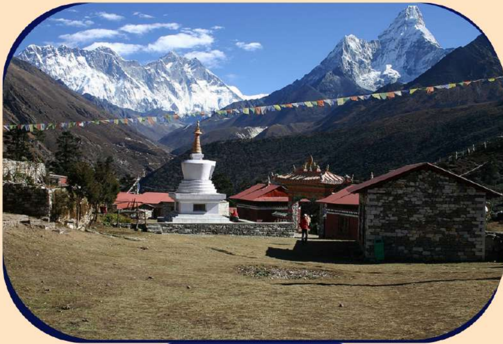
MOUNT EVEREST, NEPAL

My career aspirations are to become a leader in tech innovation, perhaps starting my own startup to solve real-world problems in emerging markets like Nepal, improving access to education through affordable digital platforms or enhancing supply chain efficiency for small businesses in rural areas something impactful that bridges technology with social good, creating jobs and fostering sustainable development while drawing on my cross-cultural experiences. As an international student ambassador with the International Student Services office, I have served for two years, and it's been an incredibly rewarding role where I have organized orientation events, guided new students through visa processes and cultural adjustments, and hosted workshops on campus life, which not only helped me make lifelong friends from diverse backgrounds but also gave me deep insights into global perspectives, leadership, and empathy, turning challenges like homesickness into opportunities for growth and community building.