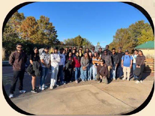
St. Louis Zoo