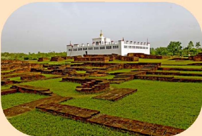
LUMBINI, THE BIRTHPLACE OF LORD BUDDHA