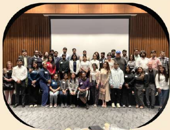
Professional Etiquette Dinner