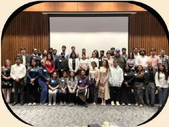
Professional Etiquette Dinner