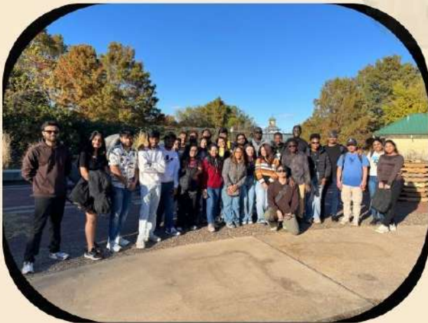
St. Louis Zoo