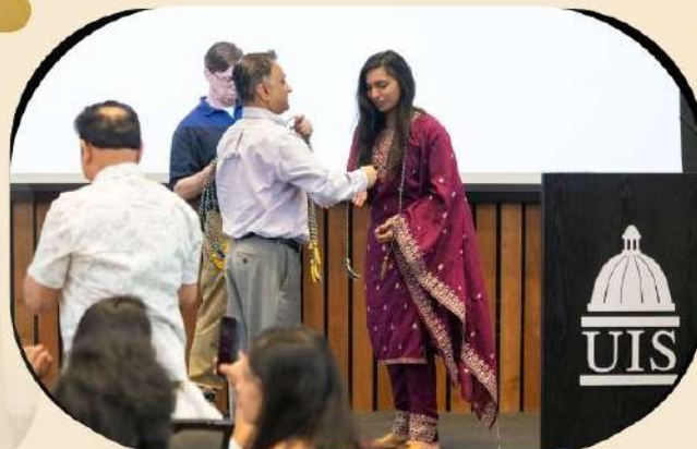
International Congratulatory Ceremony