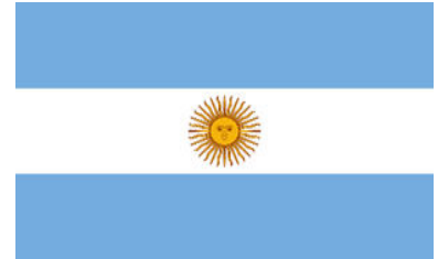
July 9th: Argentina