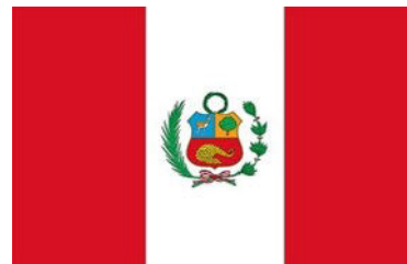
July 28-29th: Peru