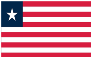
July 26th: Liberia