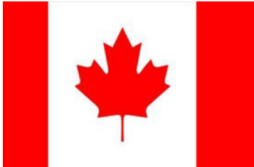
July 1st: Canada