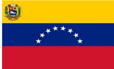
July 5th: Venezuela