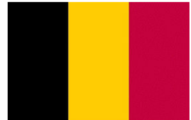
July 21st: Belgium