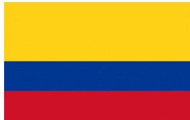
July 20th: Colombia