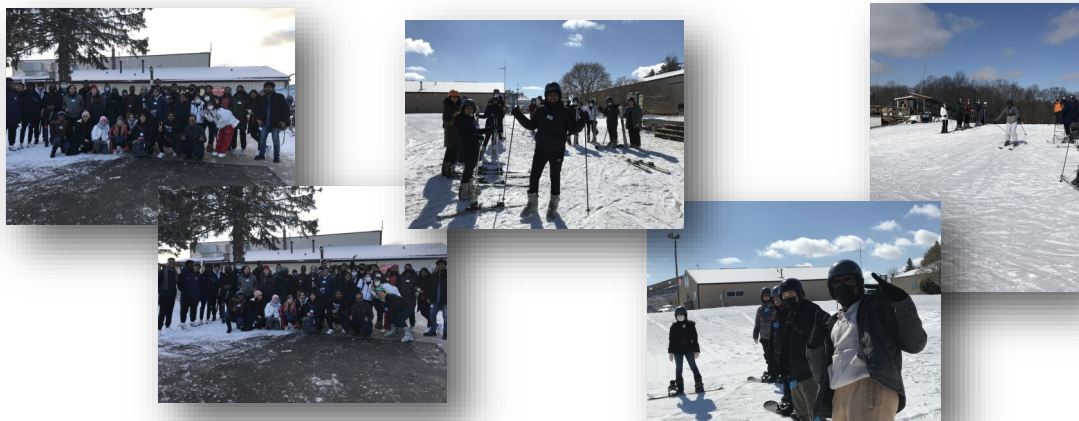
Students learned to snowboard and ski at Snow Star.