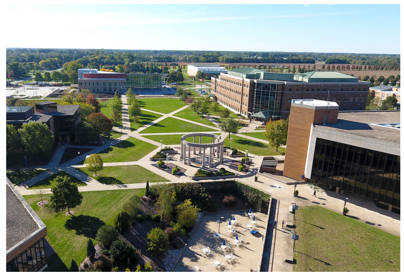
UIS Campus looking south through the Main Quad.