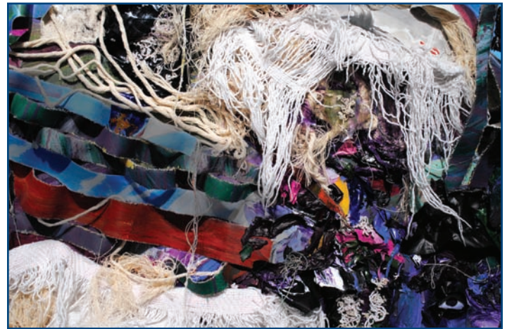
work by 2014 graduate Kayla Ico

living room wall...it's the magnificent. Whether created for a client or created for pleasure, The Magnificently Mundane showcases what it means to be graphic design.