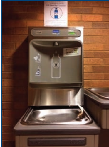
Water Bottle Filling Station in PAC

Student Green Fee Committee members review these proposals, select which ones will be funded, and then help implement the projects.