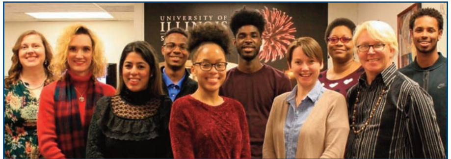
Career Development Center staff

The Career Development Center is teeming with activities for students to learn and engage in professional development opportunities, and test-drive and launch into their careers in spring 2019! Check out our Upcoming Events and Off-Campus Career Fairs & Career Events Calendars at the bottom of the career homepage for current and future events and details.