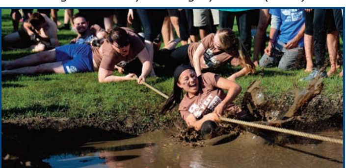
Annual Mud Tug-Of-War

mates together as a team and compete – they will have a great time and it will be a wonderful memory of their UIS experience.