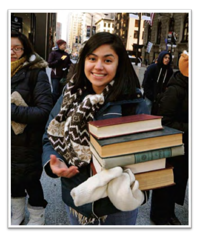
At an Immigrant Youth Justice League rally in Chicago in 2010. Contact an organization near you and get involved!

Contact an organization near you to find out how you can join advocacy efforts in Illinois to help undocumented students achieve their educational goals, support their families, and give back to society. (See Appendix C)