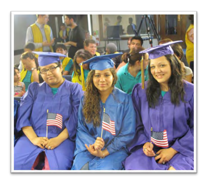
Students and supporters joined ICIRR at a press conference after the Illinois DREAM Act passed the House.

Students may still request DACA if they meet the requirements outlined on page 7.