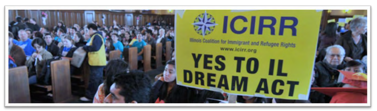
At a Chicago New Americans Rally on April 30, 2011 in support of the Illinois DREAM Act.

www.collegeillinois.org ISAC.529info@isac.illinois.gov 529 Prepaid Tuition Program PO Box 19291 Springfield, IL 62794