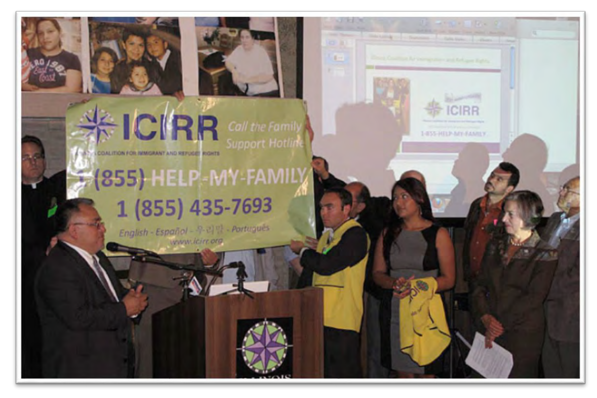
Celebrating the launch of ICIRR's volunteer run Family Support Hotline.

Contact a community organization near you if a student you know runs into any difficulties regarding his or her immigration status while trying to access higher education in the United States. Some of the difficulties he or she may encounter include