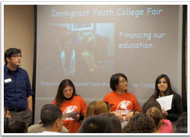
Immigrant Youth College Fair in Cicero in 2010 hosted by the Immigrant Youth Justice League and Nuestra Voz.