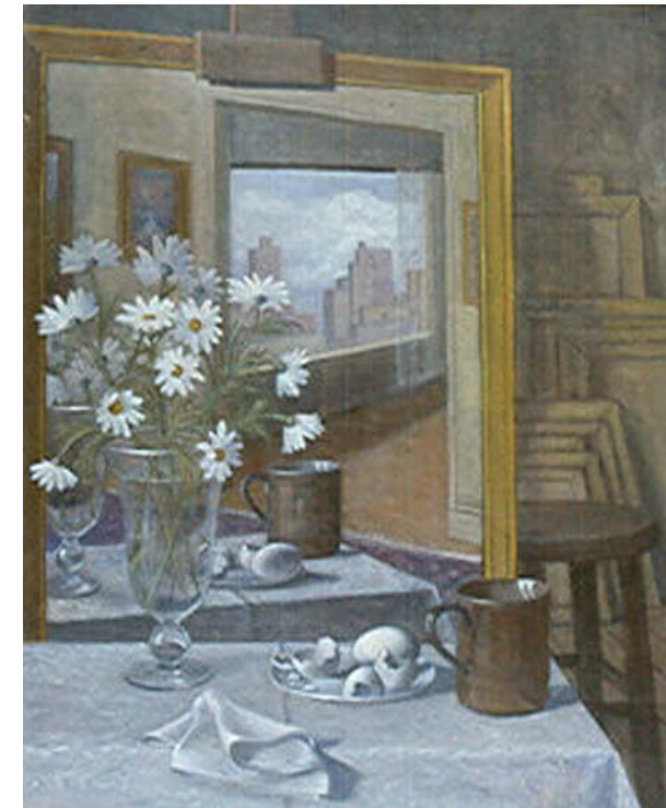
Still Life with Mirror