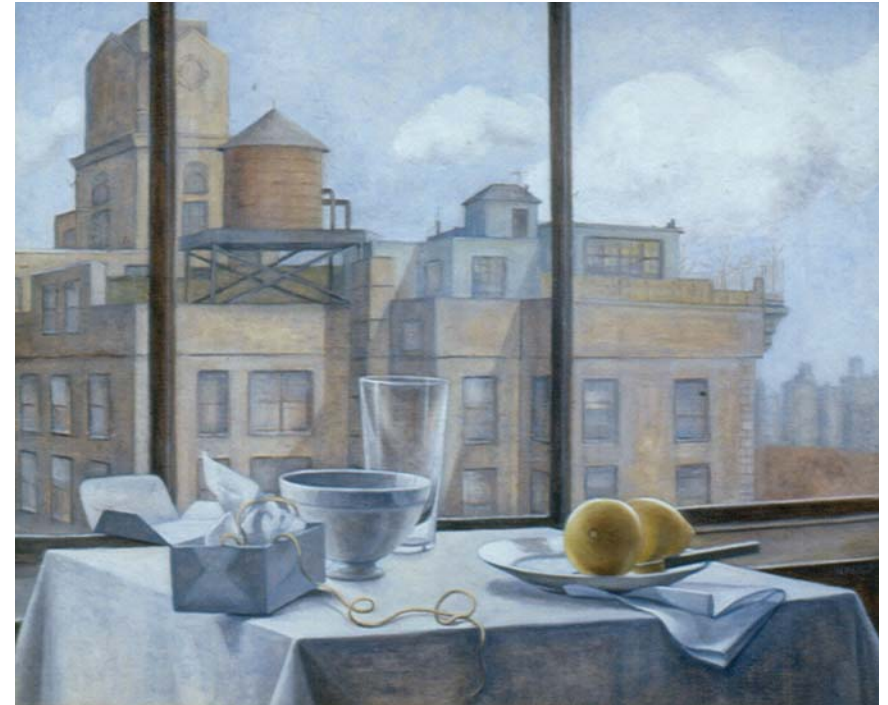
City Through the Window

The ideas of the painting, “Burning City,” (above) bear some similarities with “Departure,” although “Burning City” is painted in the style of Precisionism, one of the unofficial variations of Cubism and Futurism, characterized by the representation of the rectangular buildings, especially sky-scrapers, an industrial landscape, and the absence of people. “Burning City” is an Apocalyptic work. It depicts a burning and sinking city with no remaining living creatures. The colors of the fire and the fire itself