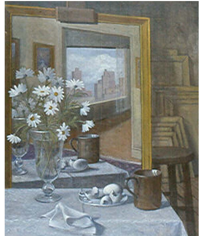
Still Life with Mirror