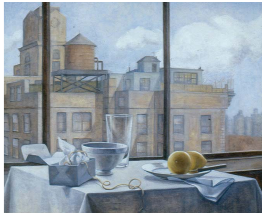
City Through the Window

The ideas of the painting, "Burning City," (above) bear some similarities with "Departure," although "Burning City" is painted in the style of Precisionism, one of the unofficial variations of Cubism and Futurism, characterized by the representation of the rectangular buildings, especially sky-scrapers, an industrial landscape, and the