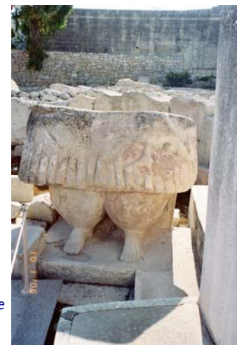
Goddess statue in the Tarxien Temples in Malta, constructed between 3600 and 3000 BCE.