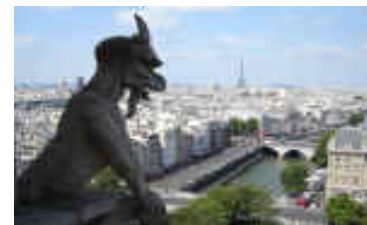
View of Paris from the Notre Dame Cathedral.