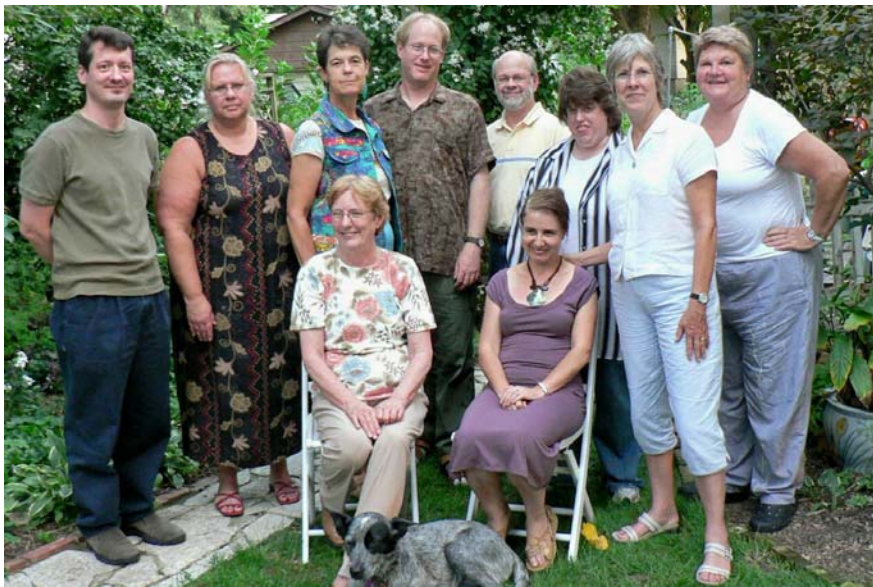
Faculty and staff from Individual Options and Liberal Studies—Fall 2006.

Given the accelerating rate of change characterizing modern society, LIS and INO faculty believe that self-directed, lifelong learning skills are essential. Learning how to learn is a prerequisite to solving new kinds of problems.