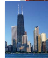
Above: President Abraham Lincoln's Tomb in Springfield, IL; Left: Chicago, Illinois; Below: St. Louis, Missouri