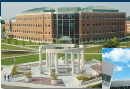
Above: University Hall and colonnade, UIS