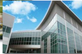
Below: The Recreation and Athletic Center, UIS