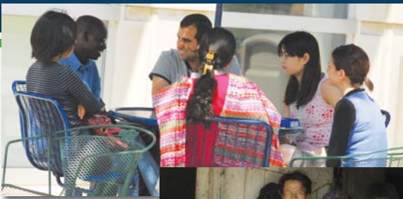
campus life and activities