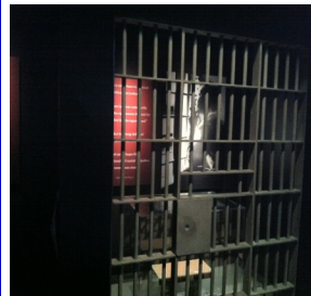
Left: Picture from America I AM exhibit. Right: Picture of Communication Law: Practical Applications in the Digital Age textbook.

The Frankenstein project: Voicing concerns regarding media's role in constructing romantic relationship ideals.